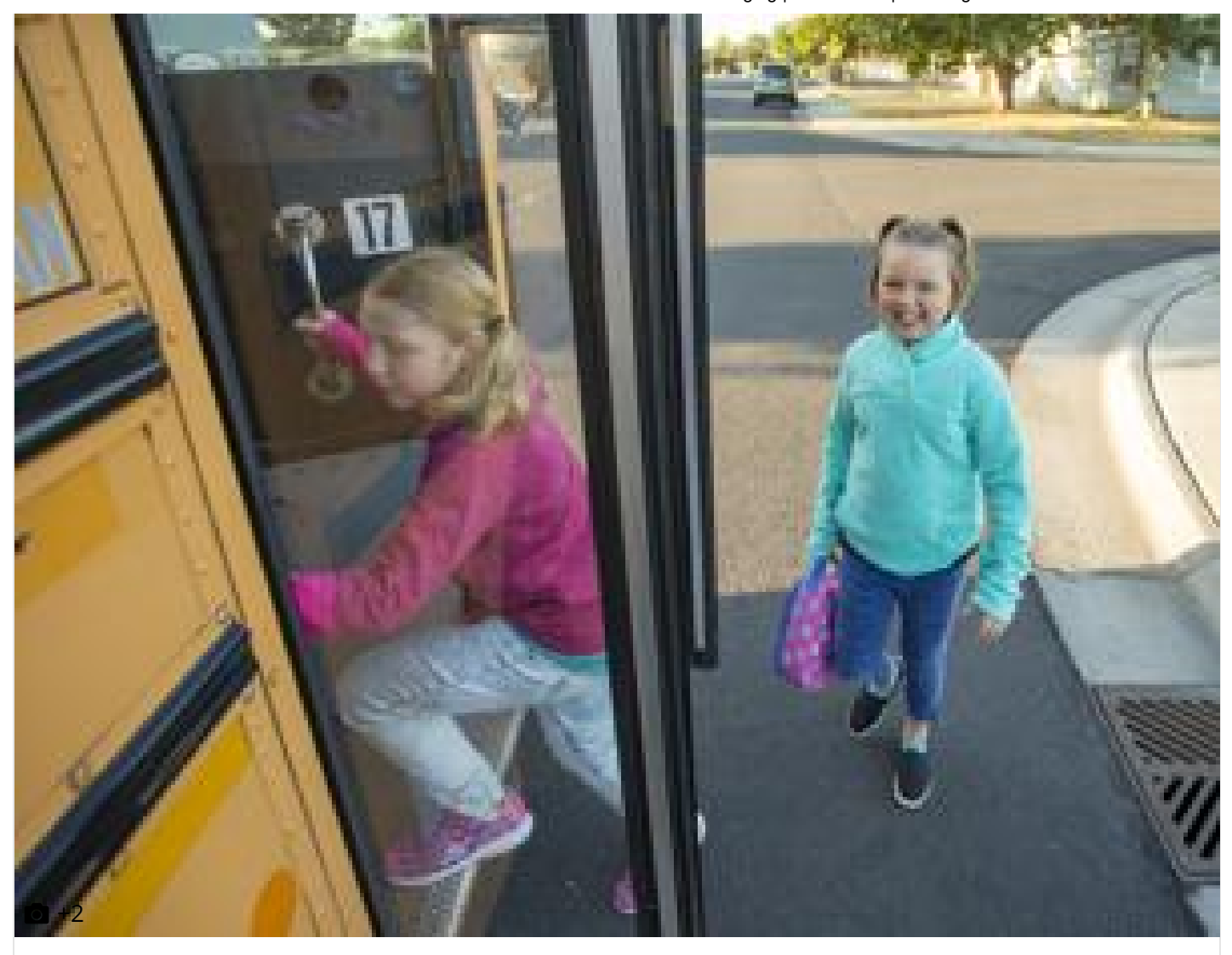
Before the bell even rings, Hermiston students start their school day with a journey on the bus