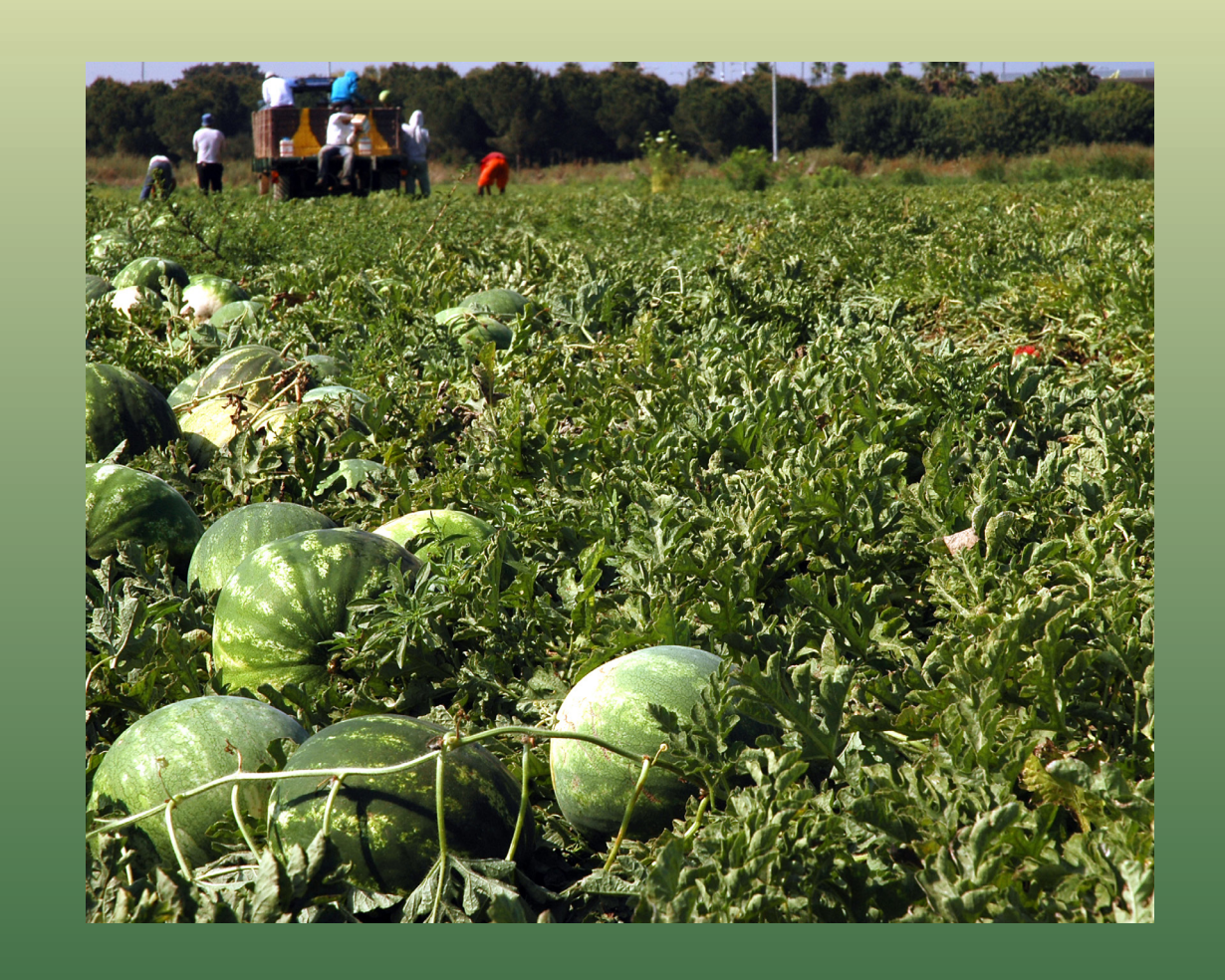
In Oregon, watermelons grow best in the warmer climate of the eastern part of the state.