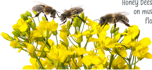
Honey bees on mustard flowers

Use the map legend to find a favorite Oregon-grown food and where bees help pollinate it!