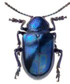
Cobalt Milkweed Beetle

Bees are champion pollinators. A team of pollinators work with bees in Oregon to make our food. The pollen of rice, oat and corn plants is moved by wind. Insect and animal pollinators include ants, beetles, birds, butterflies, flies, moths and wasps! They may move pollen in different ways, but together they help plants make more plants and help make our food!