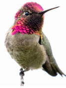
Male Anna's Hummingbird