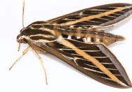
White-Lined Sphinx Moth