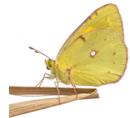
Clouded Sulphur Butterfly

Use the map legend to find a favorite Oregon-grown food and where bees help pollinate it!