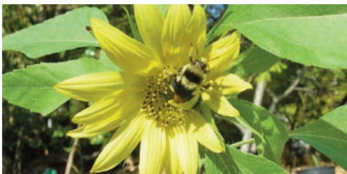
Many plants and bees need each other to survive; they are interdependent.

In cooking and nutrition, some fruits are called vegetables. That's true for tomatoes, green beans, peppers and squash. This is because their taste and the nutrients they provide are more like vegetables than fruits. For example, green beans—also called string beans—are green, fleshy pods that grow around the seeds of a bean plant. People think of them as a vegetable, but plant experts think of them as a fruit.