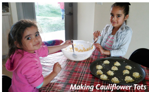
Making Cauliflower Tots

Food Hero is a research-tested social marketing campaign providing interactive demonstrations, along with policy, systems and environmental (PSE) change activities aimed at increasing all forms of F&V consumption among limited-income Oregonians. Campaign materials are in English and Spanish.