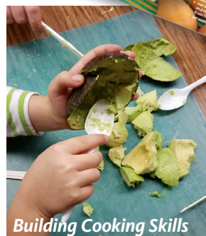
Building Cooking Skills