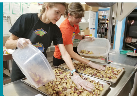
Making Potato Pals