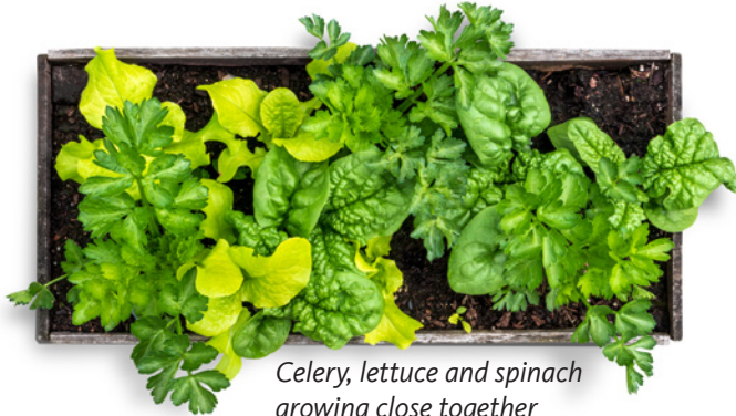
Celery, lettuce and spinach growing close together

3 Plant two different crops close together (companion planting) to get a staggered harvest of the two and increase your garden space. This method works well when you've started seedlings indoors in early spring or use plant starts. Once the plants are strong enough and all danger of frost is gone, you can transplant them into your outside garden. After your transplant has had time to grow into their new space, about two weeks to one month, plant the seeds of a cool weather crop next to them. Place the seeds where the shade of your plants can help keep the soil cool. Make sure, though, that you don't plant the seeds too close to their companion plant, especially if it grows more slowly or if both crops will soon take up a lot of space. For example, kale plants can grow large and could overpower your new seedlings. If you plant seeds near a fully grown (mature) plant, then you will already know the shade it will cast.